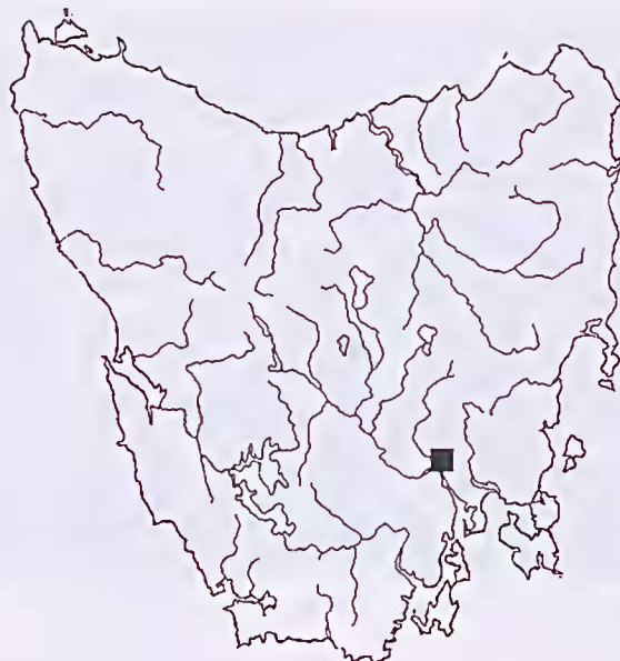
Figure 4. Distribution of Hibbertia basaltica in Tasmania.

Considerable areas of Hibbertia basaltica habitat in the Pontville–Bridgewater area have been cleared over the past 200 years for agricultural, residential and light industrial purposes. Only small remnants of native grassland on basalt remain, typically on land considered too rocky for development.